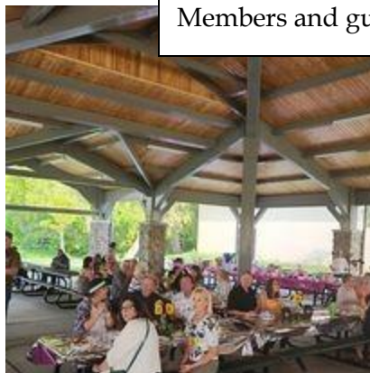
Members and guests enjoying the fun!