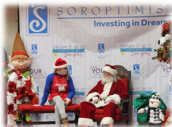
Santa is in the house!

I want to start by celebrating all of you, our members! This program is only possible because of our members who give of their time and resources.