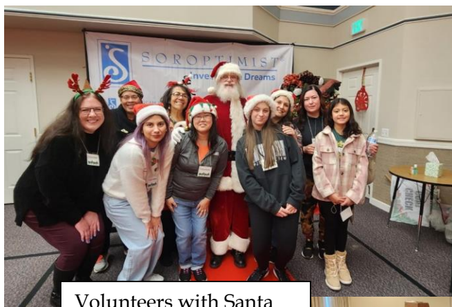
Volunteers with Santa