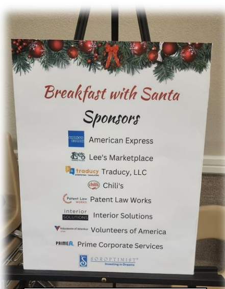
Thanks to our Sponsors

We also have amazing volunteers, donors, and sponsors. Their generosity is heartwarming. We had such an outpouring of toy donations, that each child received 3 to 4 gifts this year. The value of in-kind donations is over $9,000. We also received several large cash donations including $200 from Mrs. Clause.