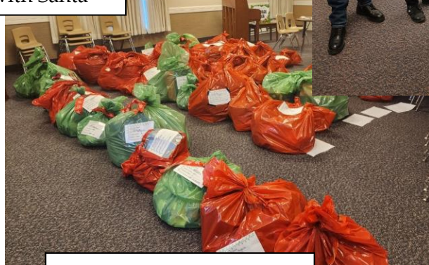
Warm clothing purchased for each child