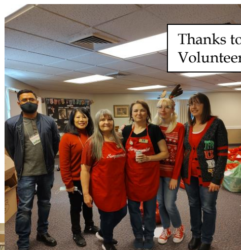
Thanks to our Volunteers!