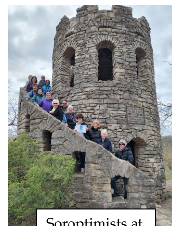
Soroptimists at Clark Tower