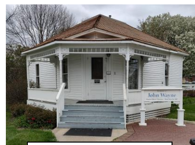
John Wayne Home