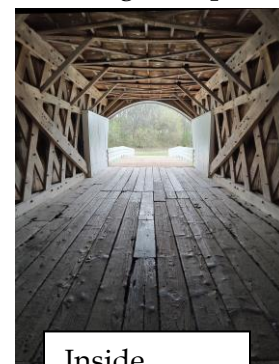
Inside Roseman Bridge