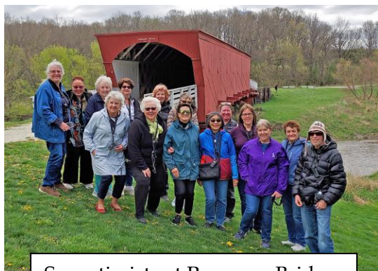
Soroptimists at Roseman Bridge