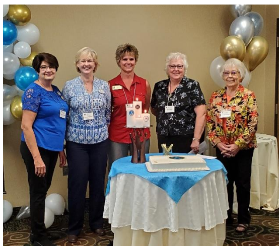
Lighting the Way Forward Candle Ceremony

After the viewing the celebration videos, we had a live celebration of our own. We had a SI Lighting the Way Forward Candle Ceremony and Cake cutting which was beautiful and touching in so many ways.