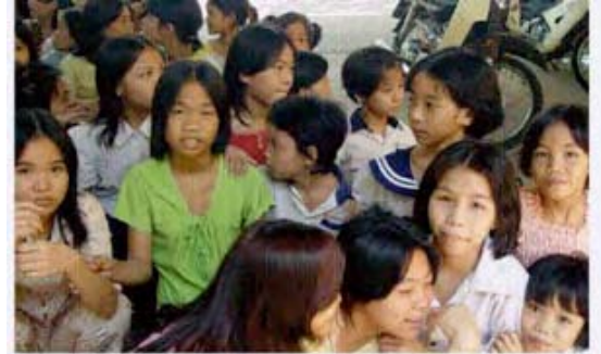
Soroptimist recycles through Cartridges for Kids to help girls in Vietnam through Loveland based Children of Peace, International. Please know that the girls shown on this card, and many like them, will be helped by your generosity.