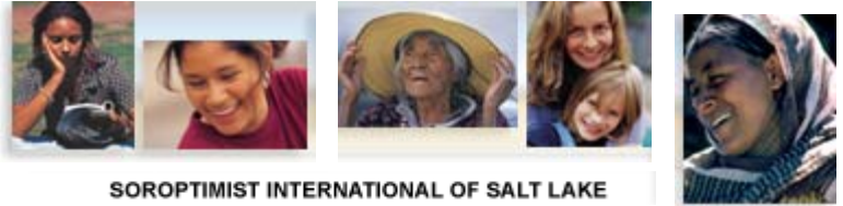
SOROPTIMIST INTERNATIONAL OF SALT LAKE